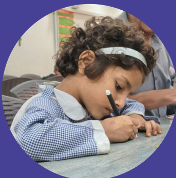
New School Year