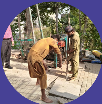
Drilling for Water