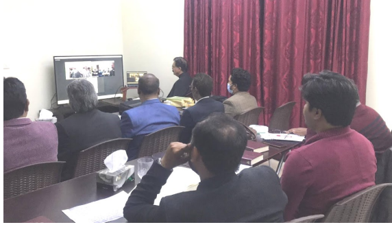
Introduction to Lutheran Theology