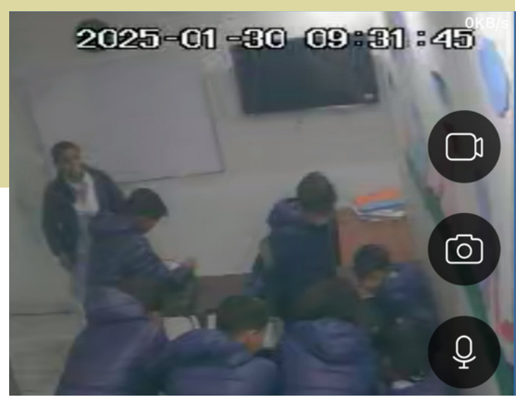
We are thankful for our security cameras. The children feel comfortable and secure. Praise God for all the blessings and for this gift.

Follow us on Facebook to stay up-to-date with what's going on at LCCP!