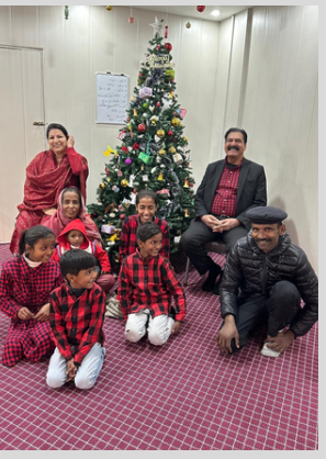
Family 2 that we adopted in 2022