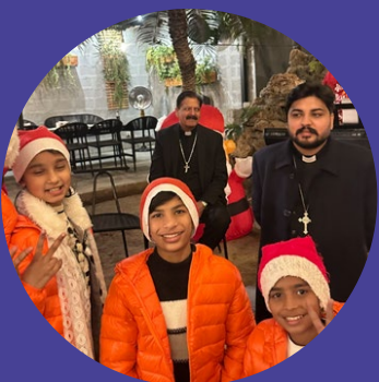
Christmas in Islamabad