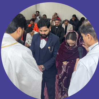
A Lutheran Wedding